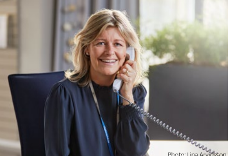
Questions? Contact the Swedish Social Insurance Agency "Försäkringskassan" at Øresunddirekt.

Find out more about social security when working in two countries at oresunddirekt.dk.